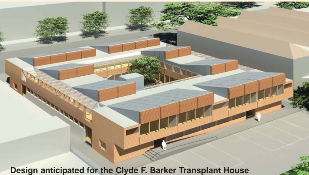
Design anticipated for the Clyde F. Barker Transplant House

Hospital of the University of Pennsylvania Department of Surgery Division of Surgery Education 3400 Spruce Street, 4 Maloney Philadelphia, PA 19104